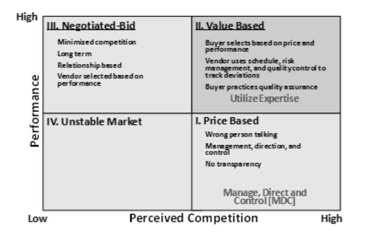
Figure 2: Construction Industry Structure.

use the Best Value Approach, however, the paradigm shift was the more difficult to change. To make this move, the owner had to not act as a technical expert and make decisions and MDC the expert vendors. The owner's technical representatives had a difficult time stepping back, forcing the expert vendors to use performance metrics and cost to identify the Best Value vendor. It showed that the clients were using the BV PIPS as a procurement and not a project/risk management approach.