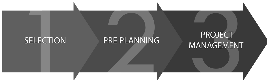
Figure 2: Phases of the Best Value Process.