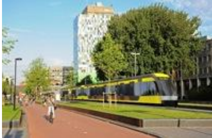
Figure 2. Impression of expansion to the Uithof