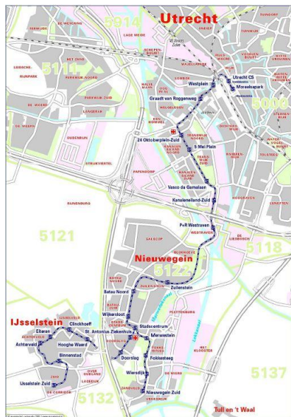
Figure 1. Utrecht tram system

The tram system of BRU, between Utrecht and its satellite cities Nieuwegein and IJsselstein (the so-called SUNIJ-line), is one of the most important public transport connections in this region and started operations in 1983. On a daily basis, 40,000 passengers are using the tramway. Until 2008, the concession holder Connexxion owned the rolling stock, stations and depot. Until 2010, the rail infrastructure was owned and managed by the Dutch mainline network operator ProRail. BRU became Asset Owner and Asset Manager of the rolling stock, stations, depot, and rail infrastructure and inherited existing maintenance contracts from predecessors.