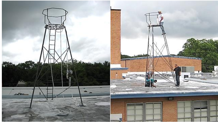
Figure 1: Hail Testing Apparatus.

After setting up and dropping each steel ball, the impact was examined to determine if there were any failures (cracks or tears) in the system. A total of 20 hail drops were performed (10 drops with 2” steel ball and 10 drops with 4” steel ball). Nineteen (19 out of the 20 hail drops) passed the test.