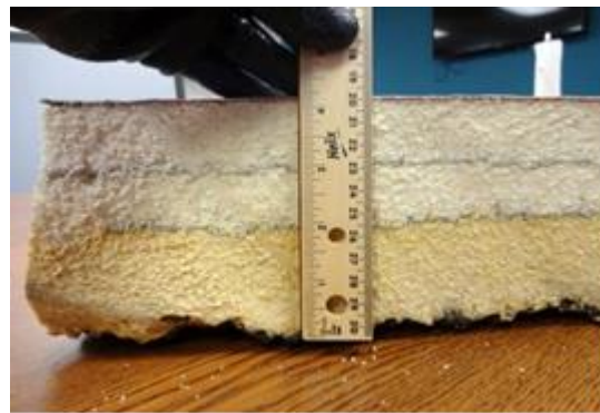
Figure 2: Three Layers of SPF (4” thickness).