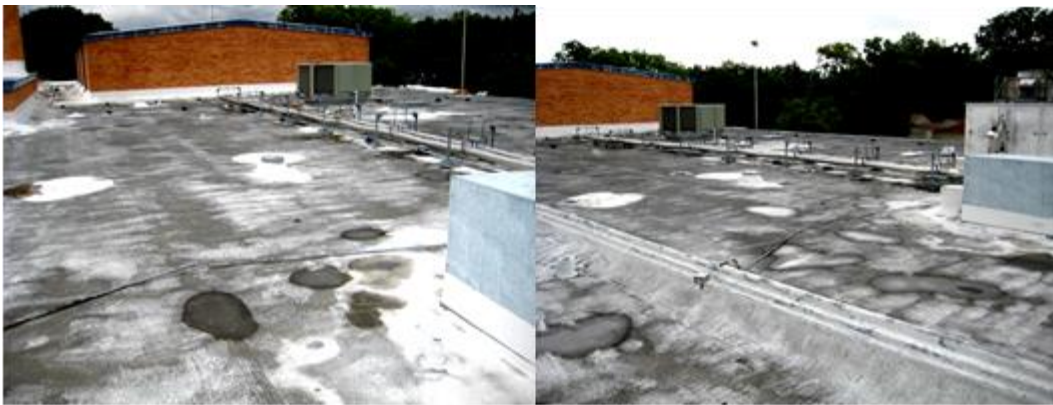
Figure 5: Actual Roof.

The authors conclude that the Alpha SPF roof system should not have been tear-off, but should have been recoated at a cost of $5.00/SF. The roof would have lasted an additional 15 years, taking the full service period of the roof at 38 years. The roof would have cost DISD less than 50% of the procured BUR system, and would have been a financial windfall. The Fosters Elementary School also shows that the Alpha SPF roof system is a renewable, green roofing system that is an economic alternative to the modified BUR system.